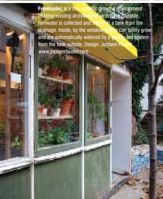
Freelander , is a site-specific growing environment utilising existing architectural structures. Outside, rainwater is collected and stored in a tank from the drainage. Inside, by the window, plants can safely grow and are automatically watered by a gravity fed system from the tank outside. Design: Jochem Faudet, www.jochemfaudet.com