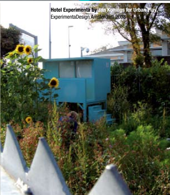
Hotel Experimenta by Jan Konings for Urban Play, ExperimentaDesign Amsterdam 2008