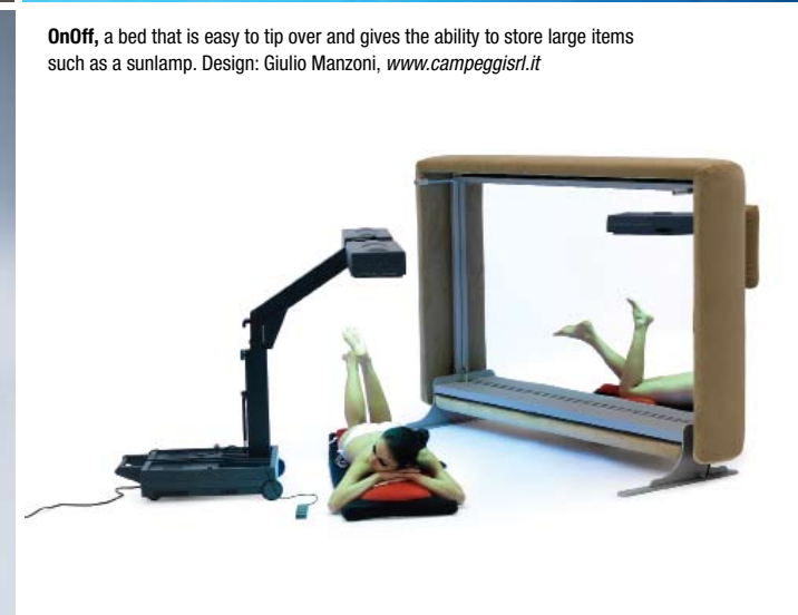
OnOff , a bed that is easy to tip over and gives the ability to store large items such as a sunlamp. Design: Giulio Manzoni, www.campeggisl.it