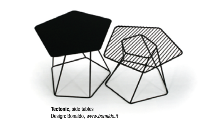
Tectonic , side tables Design: Bonaldo, www.bonaldo.it