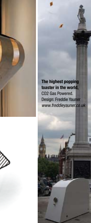
The highest popping toaster in the world , CO2 Gas Powered. Design: Freddie Yauner, www.freddieyauner.co.uk