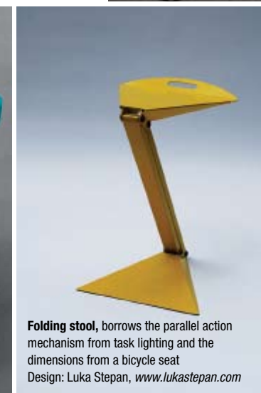
Folding stool , borrows the parallel action mechanism from task lighting and the dimensions from a bicycle seat Design: Luka Stepan, www.lukastepan.com