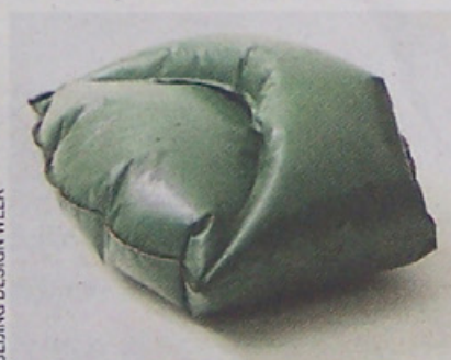
BEIJING DESIGN WEEK