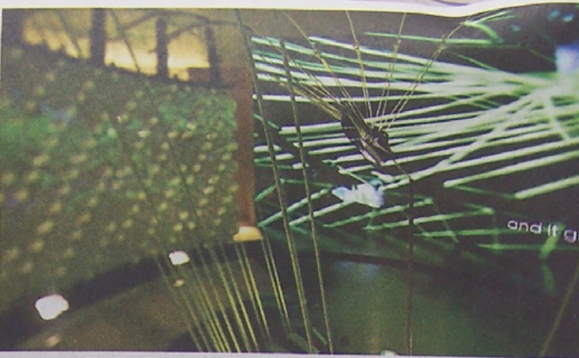
BEIJING DESIGN WEEK